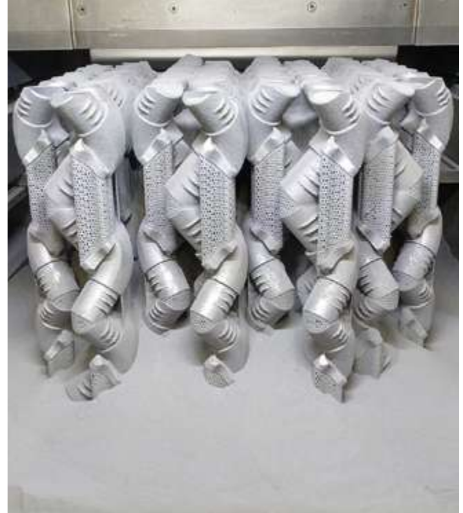
Fig. 5: 120 stacked, nested connectors printed in one process on the SLM®280 by Finnish service bureau 3Dstep Oy.