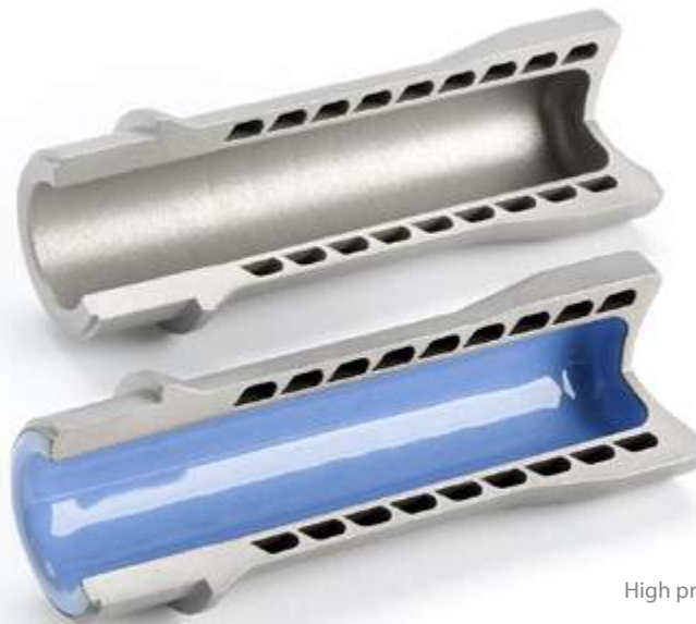
Fig. 5: High pressure reactor before and after enameling