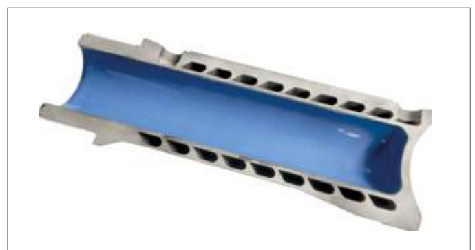
Fig. 1: Prototype, glass-lined high-pressure reactor

The combination of enameling the interior surface and integrated temperature control channels in the reactor's walls provides significantly improved heat transfer than